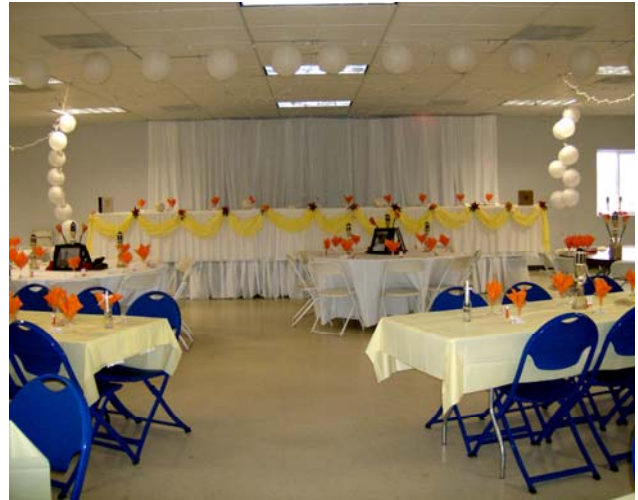
WEDDINGS & PARTIES