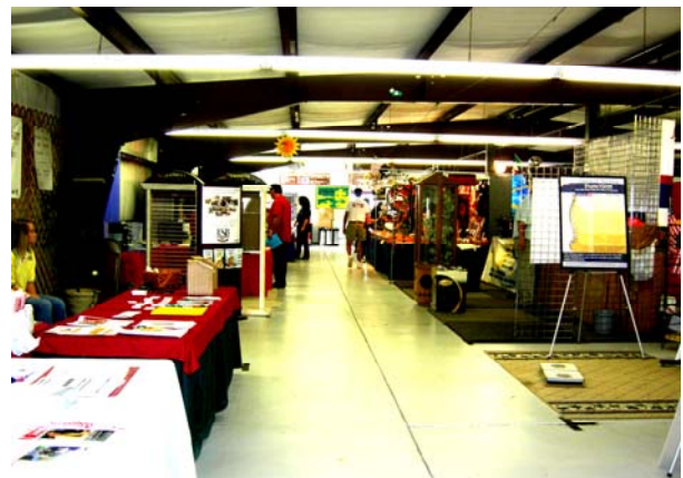
TRADE SHOWS & EXPOS

The mission of the El Paso County Fairgrounds is to provide citizens of El Paso County with a multi-use event facility which serves agricultural, business, educational, recreational, urban and youth interests of El Paso County and the Eastern Plains.